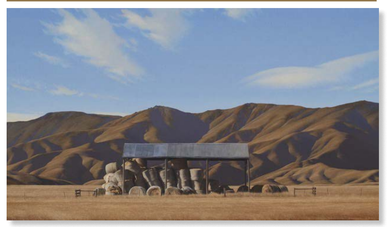
'Winter Feed, Ida Valley'. Oil on Linen 610 x 1070mm. 2021. Private Collection.