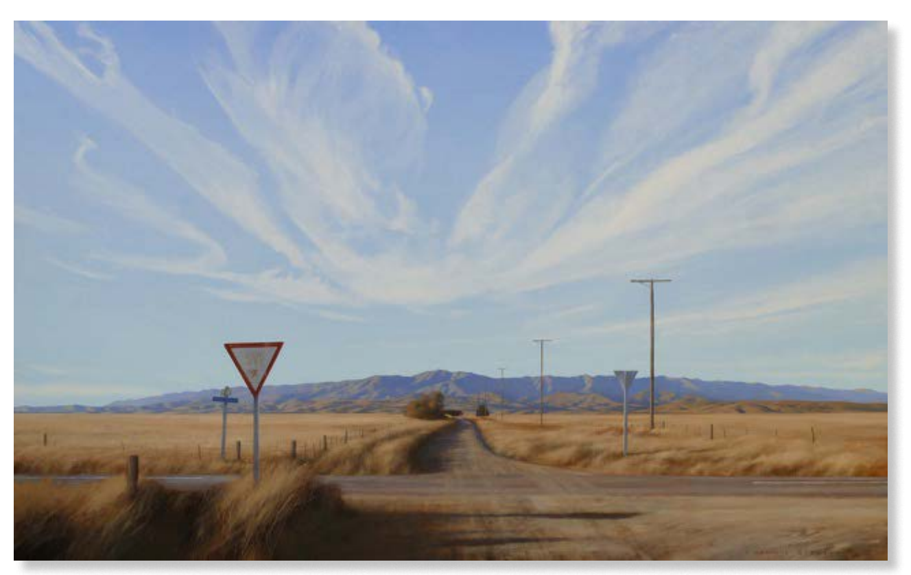
'Crossroads'. Oil on Linen 760 x 1220mm. 2020. Private Collection.