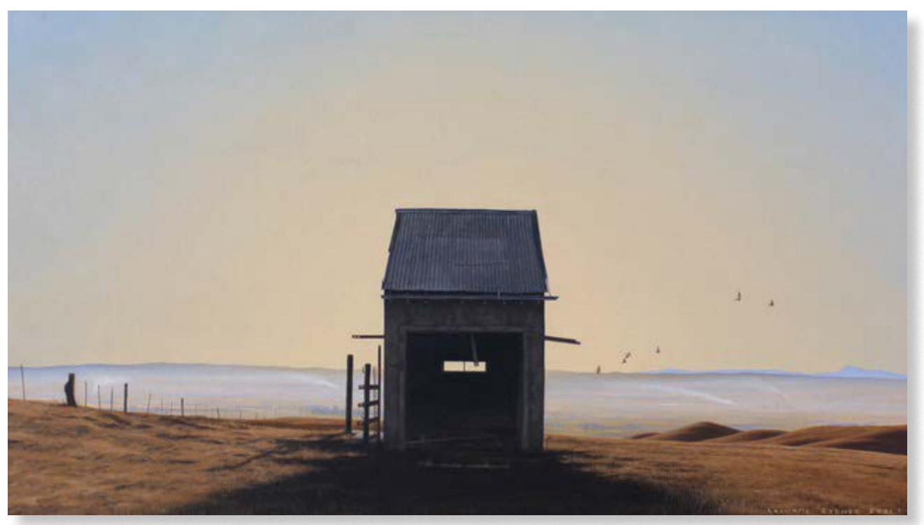
'The Slaughterhouse at Hamilton's'. Oil on Linen 610 x 1070mm. 2021. Private Collection.