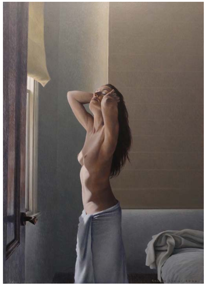
'Victoria'. Egg Tempera 710 x 510mm. 2020. Private Collection.

Oil landscapes have continued to dominate my output since the last newsletter in Spring 2020 although I did also complete two egg temperas and three watercolours. I've been promising myself a return to the egg tempera medium for years, and I still hold out for a period of total immersion in it in the months ahead – they'll be figure studies mainly, a long-planned series, but I also have a few snow images I think would work beautifully in tempera too. The many challenges the human figure presents the painter are stimulating and inspiring, very important to me these days. Watch this space, and my Instagram site. Once again paintings have been dispersed widely around the planet, with valued supporters in London. Melbourne, South Korea and here at home in New Zealand.